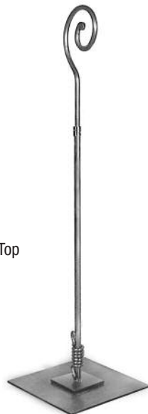
Hook Stand Adjustable Counter Top 26" to 36" height #RM/ADJ2