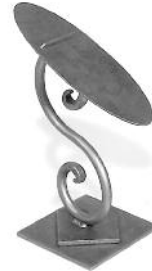
Single Shoe Stand 8" High #RM/SS308S