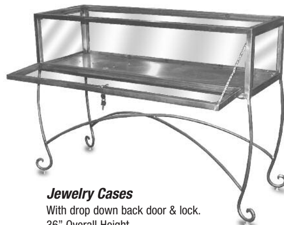
Jewelry Cases With drop down back door & lock. 36" Overall Height #RM/JC202V 12"H x 17"W x 28"L Case #RM/JC203V 12"H x 17"W x 36"L Case #RM/JC204V 12"H x 17"W x 48"L Case