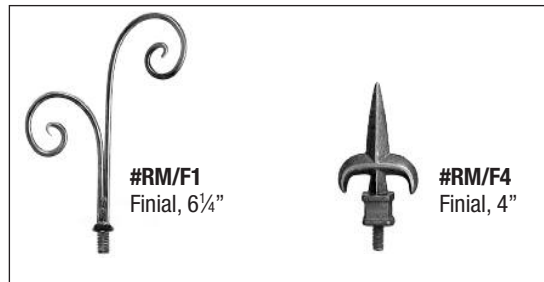
#RM/F1 Finial, 6 1/4"