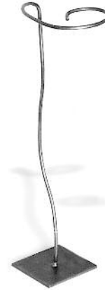
Hat Stand 16" H #RM/HS116