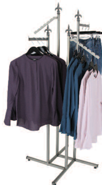
#RM/FW101V-SL 4 Way Stand w/slant arms & finial #RM/FW101V-ST 4 Way Stand w/straight arms & finial #RM/FW101V-22 4 Way Stand w/mixed arms & finial