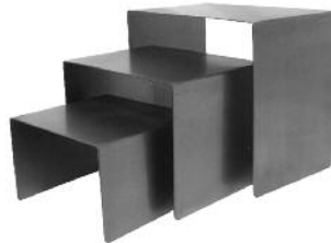
Set of 3 Cubes #RM/CS381