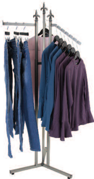
#RM/TW101V-SL 3 Way Stand w/slant arms & finial #RM/TW101V-ST 3 Way Stand w/straight arms & finial #RM/TW101V-21 3 Way Stand w/mixed arms & finial