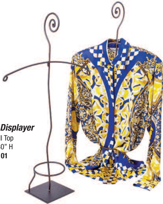
Blouse Displayer with Scroll Top 19" W x 30" H #RM/BD101