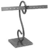
6 Pair Earring Display 7" High #RM/JDE6