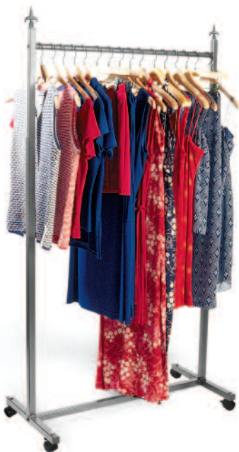
Rolling Racks adjustable from 56" to 71" High #RM/RR36V 36" Rolling Rack. Finial Included Please specify #RM/RR48V 48" Rolling Rack. Finial Included Please specify