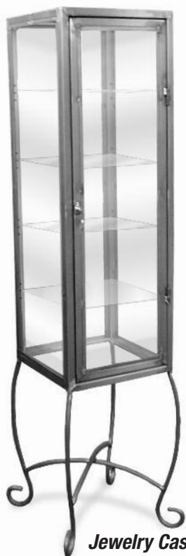
Jewelry Case 4 Glass Shelf Showcase w/Lock 16" x 16" x 72" #RM/SC1672V