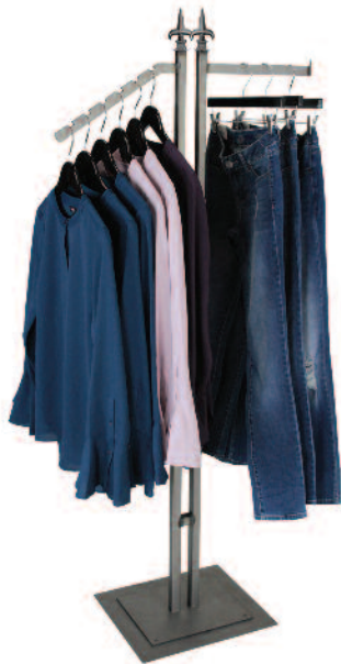
#RM/TS102V-SL 2 Way Stand w/slant arms & finial #RM/TS102V-ST 2 Way Stand w/straight arms & finial #RM/TS102V-11 2 Way Stand w/mixed arms & finial